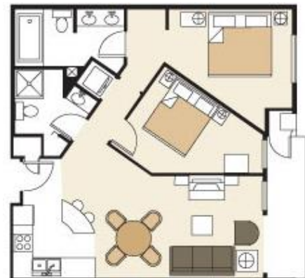
Two Bedroom Two Bath KING Suite 1 King / 1 Queen / 1 Sofa Sleeper