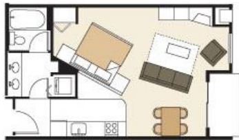
Studio/JUNIOR Suite 1 Queen / 1 Sofa Sleeper

All of our suites include a full kitchen with utensils, dining table, electric fireplace, washer & dryer, jetted tub, air conditioning, cable TV, DVD Player, hair dryer, iron, ironing board.